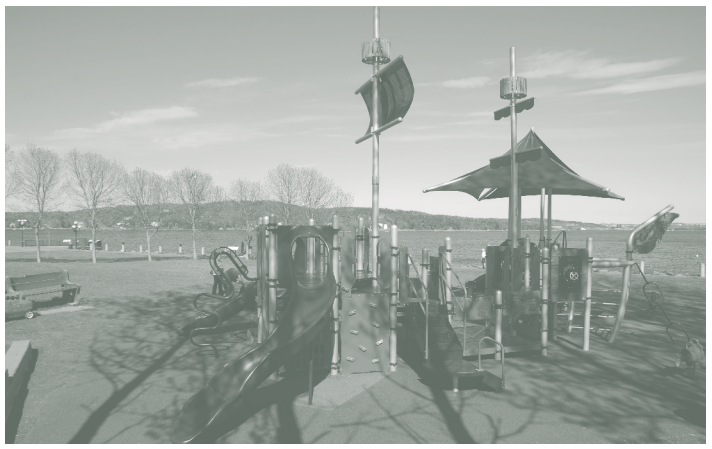
Dewolf Park playground

The playground in DeWolf Park received a complete rebuild last year and the response from parents, grandparents and kids has been great. The equipment is now up to code, and has improved visibility and accessibility, while maintaining its nautical theme. The upper playground in Ridgevale was also replaced, and there were repairs made to playgrounds in Oakmount, Peerless, The Ravines, Paper Mill, and off the Hammonds Plains Road. Additional equipment will be added again to the Oceanview/Nine Mile Drive playground, and planning and budgeting are underway to replace of the aging equipment in The Ravines and Bedford Hills playgrounds, within a couple of years. I also plan to work with residents in the Hemlock Ravines/Larry Uteck area to improve playground and green space in the area off Transom. A community garden is also possible, if desired by the residents in the area. Parents at Eaglewood School have begun fundraising for playground equipment, so I have earmarked some funds out of the District Capital Fund for this project.