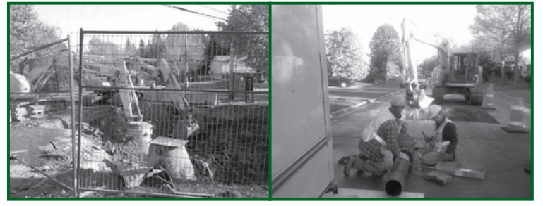
Many thanks to Halifax Water, on behalf of Ridgevale residents, for installing a new emergency shut-off valve and also for correcting the pipe shifting to resolve the sewer back-up issue.