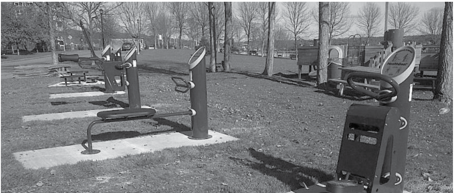
New outdoor fitness equipment in DeWolf Park

I look forward to seeing and hearing more from Waterfront Development and encourage you to join me in opportunities like these for public engagement. I will continue my work per our direction at HRM, and as always will keep you informed as the schedule for these sessions is announced.