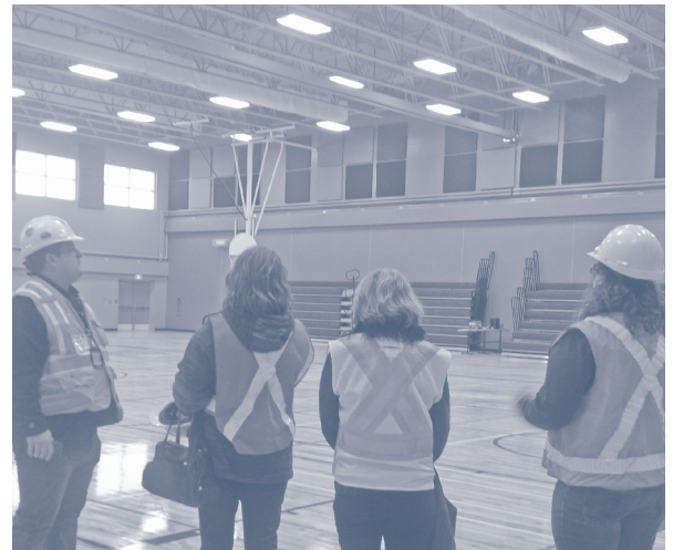
'Sneak Peak' of inside CHDHS' new gymnasium