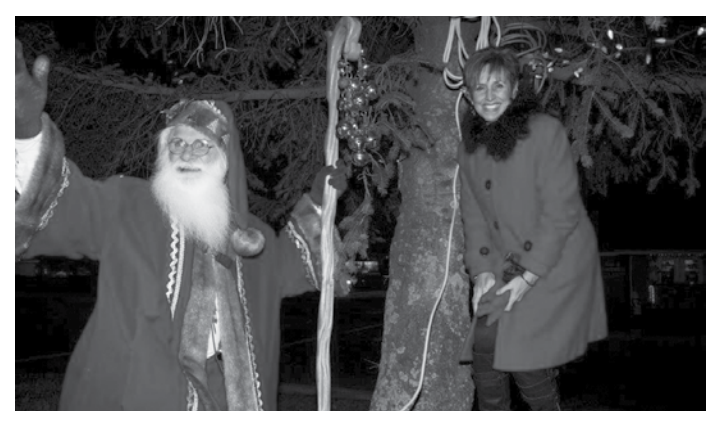
Under the Christmas tree with Santa

The Association for Business in Cole Harbour (ABCH) kicked off the Holiday Season with a tree lighting on November 30th at the Cole Harbour Fire Station parking lot. The tree is lit for everyone's enjoyment at the corner of Ashgrove and Cole Harbour Road.