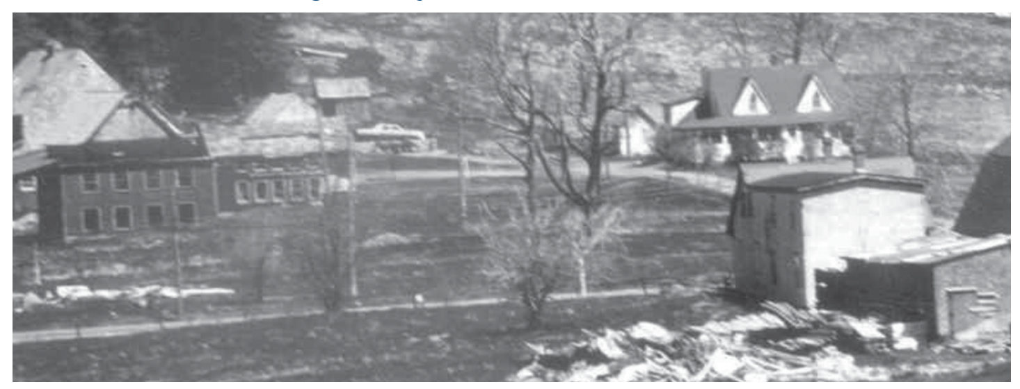
Harris Farm and Cole Harbour Road circa 1973

The Cole Harbour Rural Heritage Society is celebrating 40 years since members of the community joined together to save what they could of the once prosperous, and rapidly disappearing, agricultural community. With a great deal of passion and hard work, the Society was successful in saving the Harris Farm from demolition and becoming what is now known as the Cole Harbour Heritage Farm located at 471 Poplar Drive.