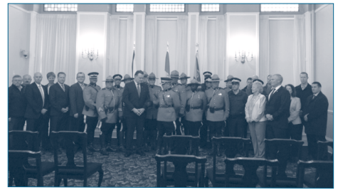
The Mayor, Councillors, members of the RCMP and guests commemorated the one year anniversary of the tragedy in Moncton.