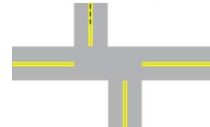
Diagram of off-set intersection for illustrative purposes only

(q) “off-set intersections” include two local streets that intersect with a major collector street or arterial street at two closely spaced T-junctions, instead of at a four legged intersection;