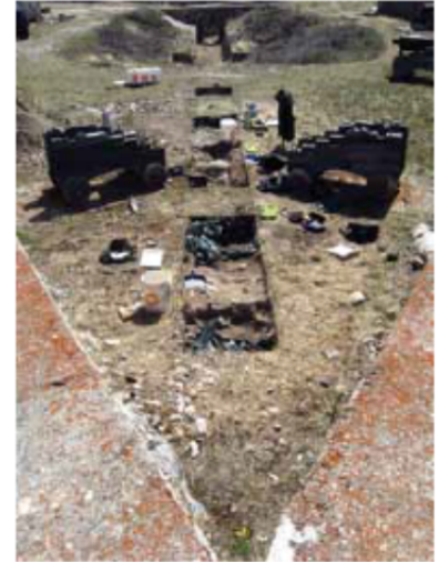
Nearby archaeological resources were protected when stabilizing the Prince of Wales Fort in Manitoba. Strategically placed archaeological investigations on the surface of the ramparts established the extent of artifacts, including their depth below the surface.

Part b) acknowledges a responsibility to protect archaeological resources, but also reinforces the message that they must be protected and preserved in situ . This is a highly regulated aspect of conservation: one must identify and engage the authority having jurisdiction. The information required to best preserve and protect the site is gained from a variety of archaeological interventions. A strategy to recover the information using the most appropriate and effective methods needs to be developed in an effort to strike a balance between gaining knowledge from investigations and preserving the resources in situ .