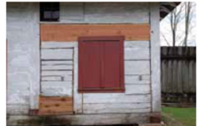
A condition assessment of the exterior walls and frame of this Storehouse at Fort Langley, BC found extensive deterioration of some timbers, which required replacement in kind . The dimensions, hewn finish and species of wood used in the repairs matched those replaced. The photograph shows part of one storehouse wall after the repairs were completed, but before the new timbers were whitewashed.