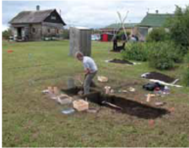
Ground-penetrating radar was used at McPherson House in Fort Simpson, NT; this guided archaeological excavations limiting the impact on the site.

(a) Evaluate the existing condition of character-defining elements to determine the appropriate intervention needed. (b) Use the gentlest means possible for any intervention. Respect heritage value when undertaking an intervention.