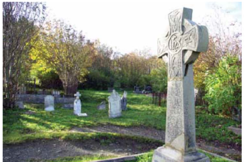
A condition assessment and evaluation undertaken before an intervention at Belvedere Cemetery in St. John's Ecclesiastical District, would reveal that the well-aged and weathered patina found on the grave markers is not damaging. It is in fact a character-defining element of this historic place and should be preserved.

Investigations themselves are forms of intervention and as such should follow a minimal intervention approach. Investigations should begin with observation and non-invasive probes followed by careful sampling and physical openings or selective disassembly if required. The objective is to obtain enough evidence without unnecessarily disturbing the historic place.