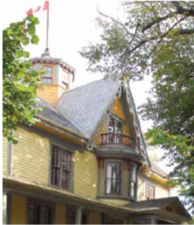
When the windows of Lefurgey House in Summerside, PEI were damaged in a fire, instead of replacing the entire windows, only the broken glass was replaced. The replacement glass, salvaged from a nearby house that was replacing its windows, had similar properties and wavy appearance.

Conserve heritage value by adopting an approach calling for minimal intervention .