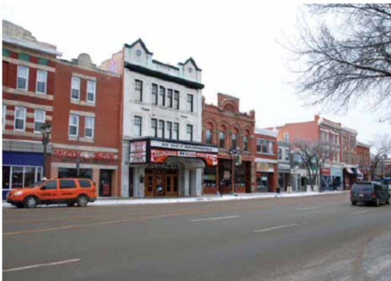
The Old Strathcona Provincial Historic Area in Edmonton is a diverse historic district. The individuality of each building and evidence of the era of its construction has been maintained. Earlier simply constructed wood buildings stand alongside later more sophisticated masonry buildings and modern infill structures.

The materials removed from historic places are often salvaged and reused. Careful consideration must be given to how and where this is done. For example, using a salvaged lamppost from an historic landscape with identifiable characteristics at another site does not conform to the standard. On the other hand, using recycled bricks of the same age and appearance, or reusing identical windows within a building are appropriate from both conservation and sustainability standpoints. Where it is deemed critical to the honesty of the work, such additions can be rendered distinguishable in a discreet way.