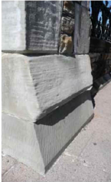
The new pieces of stone on the Wellington Wall at the Parliament Grounds in Ottawa are clearly visible on close inspection due to a different tooling technique.

(a) Make any intervention needed to preserve character-defining elements physically and visually compatible with the historic place and identifiable on close inspection. (b) Document any intervention for future reference.