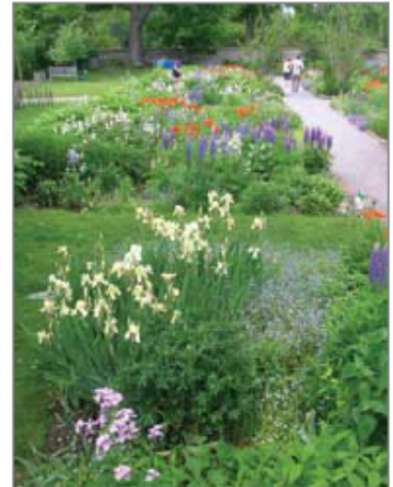
In areas of Maplelawn and Gardens NHSC in Ottawa where insufficient historical evidence existed, a Rehabilitation approach was taken. New perennial beds were designed using adjacent layouts and historical information from other parts of the garden as inspiration. This approach resulted in compatible new beds that completed the garden and strengthened its overall heritage value.

Addressing significant deterioration is an implicit goal of this standard. If deterioration is not properly addressed, it can result in a loss of heritage value.