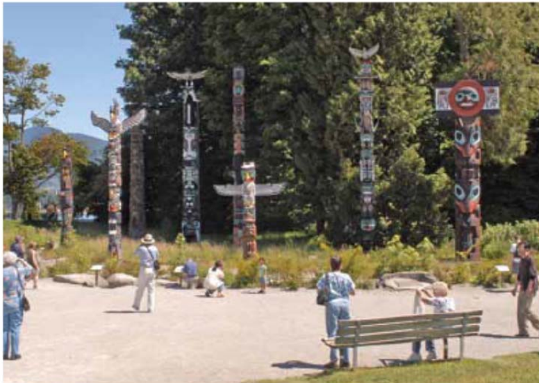
Over the years, several landscape architects and architects have made specific contributions to the evolving functions of Vancouver's Stanley Park. These include the play areas, totem groupings and aquarium that are now integral to the park's heritage value.