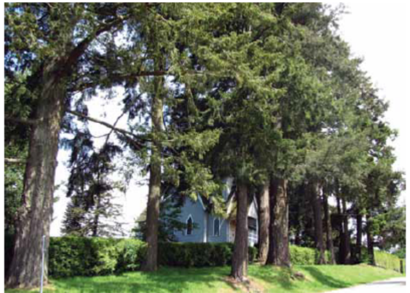
The rhythmic pattern created by the regular spacing of trees along the street is a character-defining element of the Avenue of Trees in Surrey, BC that can be used as evidence to restore the row if a gap develops.

A preservation or rehabilitation project may also include elements of restoration, such as work on an ornamental fountain in the centre of a formal garden. Any restoration interventions must be based on clear physical, documentary or oral evidence and detailed knowledge of the earlier forms and materials.