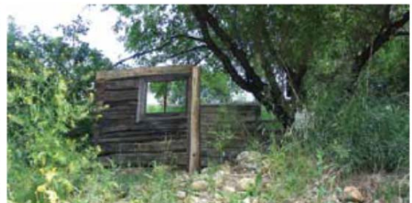
The character-defining elements of Doukhobor Dugout House NHSC in Saskatchewan, such as the window frames, had suffered visible deterioration from exposure to the elements. A long-term repair solution was necessary to prevent further decay and to preserve the site's heritage value.

Following the reinforcement treatment of treating the logs with preservatives, collapsed character-defining elements were reassembled based on records from previous interventions and existing traces on the site.