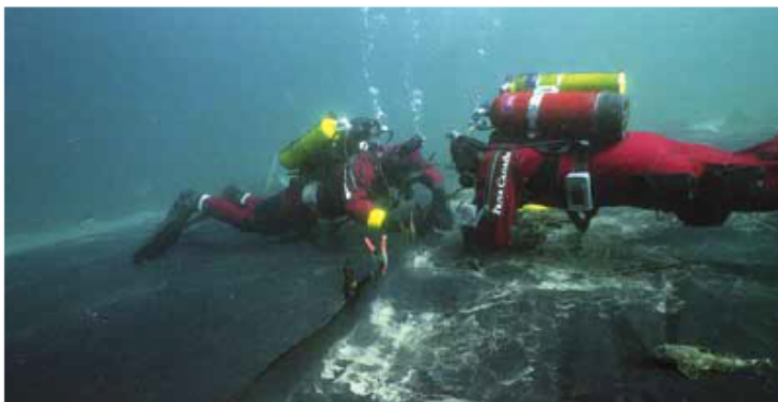
Wrecks at Red Bay NHSC, NL, such as this Basque Period wreck, are reburied using sand and tarp to ensure their long-term preservation. Their condition is periodically assessed through monitoring.

Replacement in kind may sometimes be difficult, and substitute materials may be necessary when the original materials are damaging to character-defining elements or hazardous to public health. Some mid-20 th century materials are no longer made or cannot be manufactured in small batches. In a place where the heritage value depends on a material that is no longer available, the ongoing loss of the material will eventually lead to a difficult choice: accepting breakage or replacing the entire material or assembly with one that is physically and visually compatible with the original.