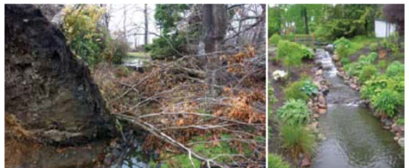
The extensive damage caused by Hurricane Juan to the Halifax Public Gardens required substantial replanting. The large scope of work is still considered a minimal intervention because any less work would have negatively affected the heritage value of the place.

Minimal intervention has different meanings for Preservation , Rehabilitation and Restoration . In the context of Preservation , it means undertaking sufficient maintenance or repairs to ensure the longevity of the place while protecting heritage value. In the context of Rehabilitation , it might mean limiting the proposed new use, addition or changes. In a Restoration , minimal intervention is a delicate balance between removals and recreations to represent the historic place's condition at a specific time in its history.