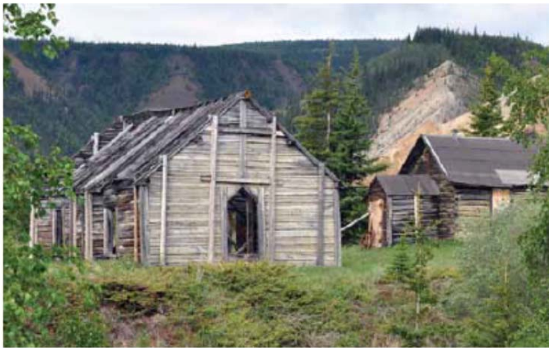
These buildings, along with others at St. Luke's Anglican Rectory and Church in the Yukon, were temporarily stabilized using a variety of measures including adding sandwich bracing, cable bracing, heavy frames, roll roofing, and covering door and window openings in order to keep out snow and rain. Stabilization allows the structures to be adequately researched and their eventual restoration to be planned.