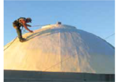
The dome of Melville City Hall was originally an uninsulated, painted-metal covering that caused persistent condensation problems. Applying insulating polyurethane foam with aluminized coating was a cost-effective solution that was compatible with the historic metallic look of the dome. If a more elaborate solution is contemplated in the future, the polyurethane could be removed.

Interventions to accommodate rapidly evolving technologies or short-lived objectives must be designed with particular attention to reversibility. If the new element is equipment that requires regular replacement, it is important to anticipate a large enough access for future upgrades.