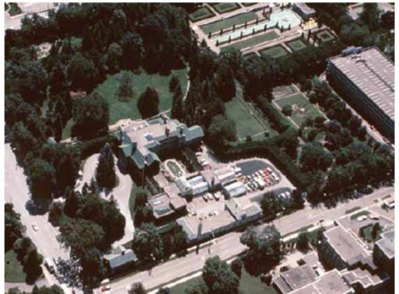
The grand residential estate at Parkwood in Oshawa is a cultural landscape that covers 4.8 hectares. Aerial photography was used to document the large-scale site during the conservation process.

While the main reason for making interventions identifiable is honesty, it is also a means of keeping a record of the place. The historic place itself is its own best document.