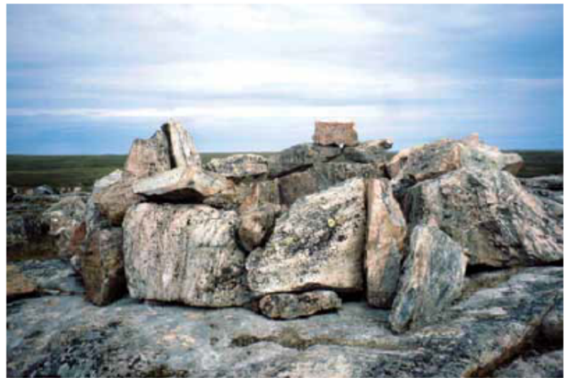
Centuries ago, the inland Inuit, or Kivallirmiut, recognized the hunting potential of the annual fall crossing of massive herds of caribou and began establishing seasonal camps along the Kazan River. Today Fall Caribou Crossing NHSC in Nunavut, is noted not only for its archaeological remains and former importance to the Kivallirmiut, but also for its natural landscape, continued use as a hunting area and the vitality of the oral history and traditions of the people who know it best. Moving any of these stones would impair heritage value.

Part (c) addresses the wholeness of a place and reinforces that spatial relationships can be character-defining. In a garden, for example, moving a central feature to another location affects the heritage value of the entire landscape. In an archaeological site, location may be critical to understanding other elements that are now missing. In an engineering work, machinery moved from its original position can lose part of its meaning, thus diminishing its heritage value.