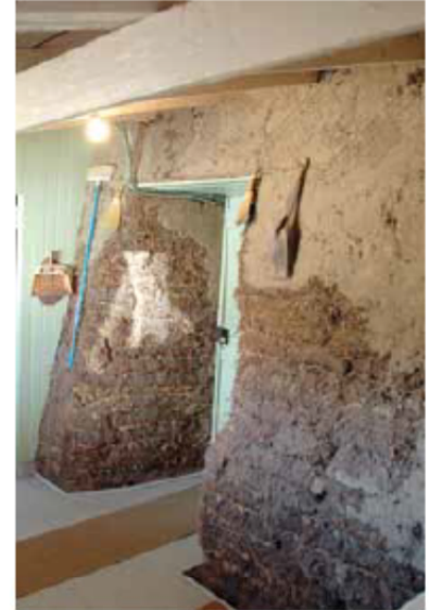
The lean-to is a character-defining element that shows the evolution of the Addison Sod House in Saskatchewan from a rustic sod dwelling to a comfortable home. Removing the later changes to restore the house to an earlier period would not be appropriate because it would remove elements that have heritage value.

A fine old storefront that has been modernized may have lost its heritage value. However, some changes may have acquired value, such as an art-deco stainless steel over-cladding or a marquee added to a popular urban theatre. Not every change to an historic place has heritage value, but those that do should be identified in a Statement of Significance. For historic places that were formally recognized some time ago, the process of determining if there is heritage value associated with later changes is an important step in the conservation process.