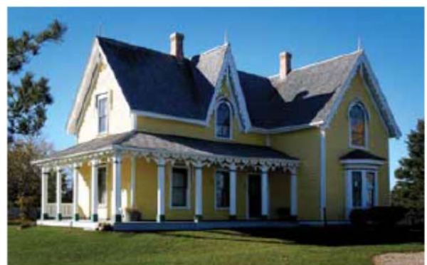
Based on documentary evidence, including an 1880 engraving, the original fenestration of the Bideford Parsonage Museum in P.E.I. was restored and roof finials replaced.