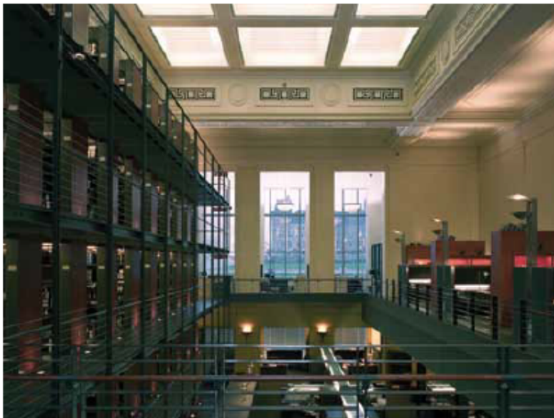
Space to temporarily house the Library of Parliament in the former Bank of Nova Scotia Building on Sparks Street in Ottawa. The entire intervention was designed to be reversible.