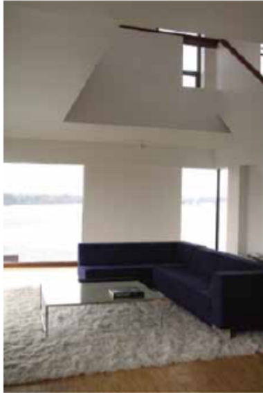
The character-defining interior features and finishes, such as the birch floors, window frames and views of the city at Habitat 67 in Montreal, have been carefully maintained, repaired and retained.

(a) Conserve the heritage value of an historic place . (b) Do not remove, replace or substantially alter its intact or repairable character-defining elements . (c) Do not move a part of an historic place if its current location is a character-defining element.