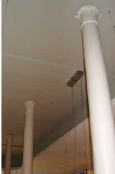
These cast iron columns were uncovered and restored when CentreBeam Place, in St. John, was rehabilitated.

(a) Repair rather than replace character-defining elements from the restoration period. (b) Where character-defining elements are too severely deteriorated to repair and where sufficient physical evidence exists, replace them with new elements that match the forms, materials and detailing of sound versions of the same elements.