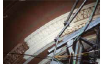
When restoring decorative plaster in the Walker Theatre in Winnipeg, moulds were made of existing plaster elements. The deteriorated plaster was then patched and repaired using the moulds to match the original.