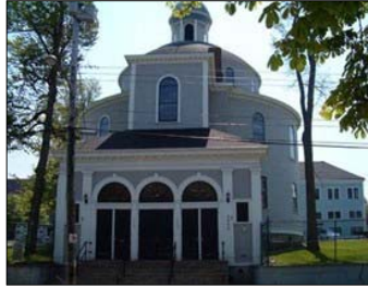
St. George's Round Church