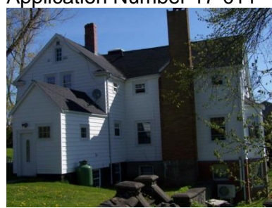
Application Number 17-011