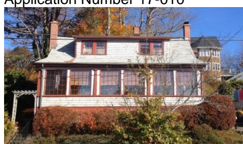
Application Number 17-010

Address: 42 Summit Street Name: James A. Lawlor House