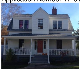
Application Number 17-016