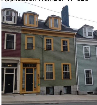
Application Number 17-026

Address: 5145 Morris Street Name: E.B. Strickland House