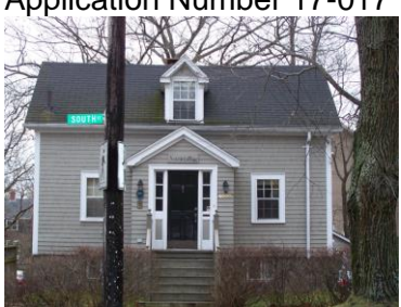
Application Number 17-017

Address: 6080 South Street Name: Acacia Cottage