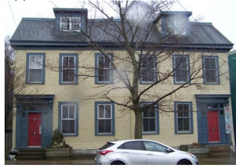
Application Number 17-003