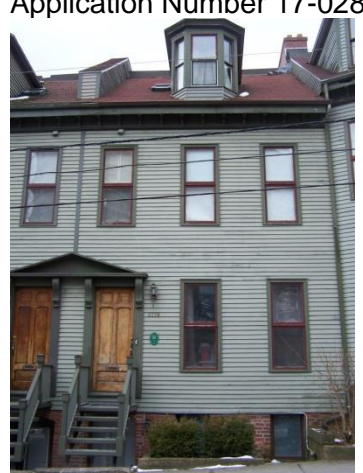
Application Number 17-028

Address: 5178 Bishop Street Name: C.H. Willis House