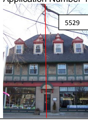
Application Number 17-012

Address: 5529 Young Street Name: Emporium Company Store