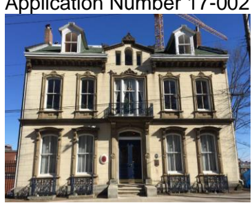
Application Number 17-002

Address: 1459 Hollis Street Name: Benjamin Wier House