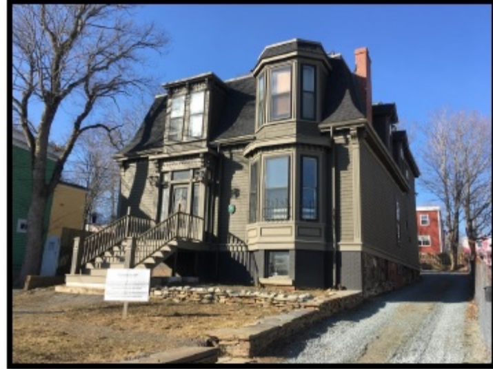
Before and After Renovations