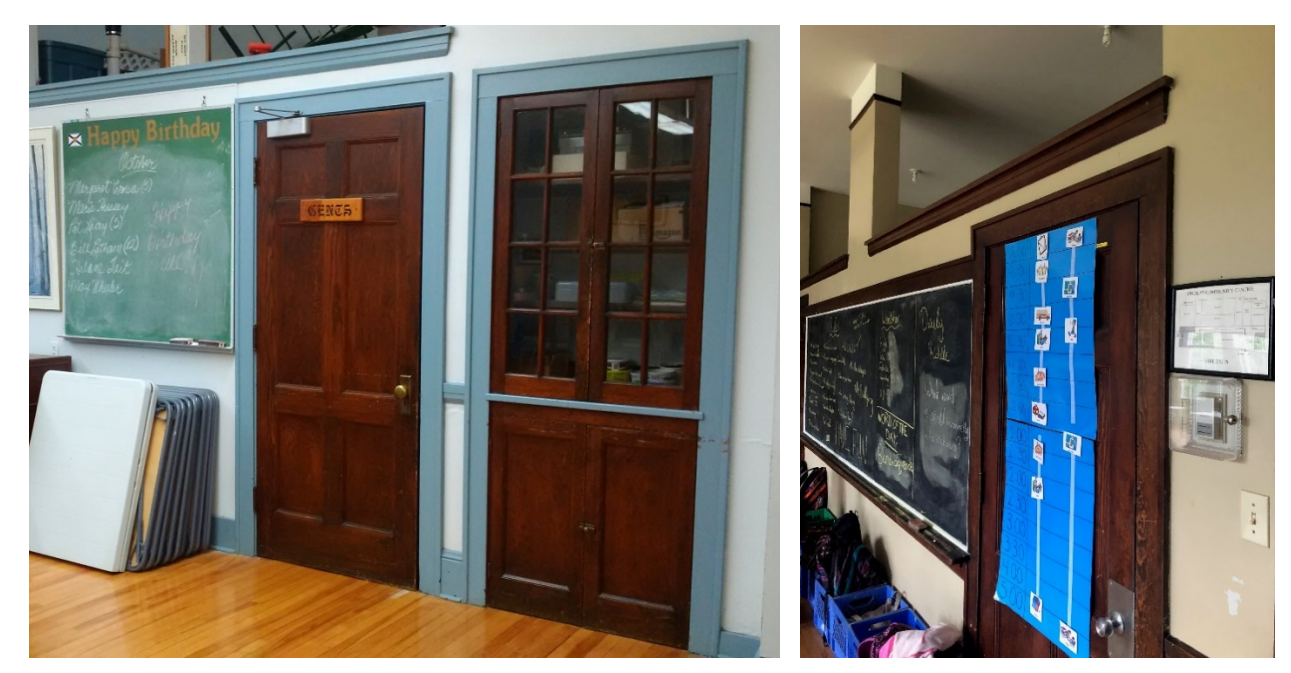
Retractable Wall between Classrooms