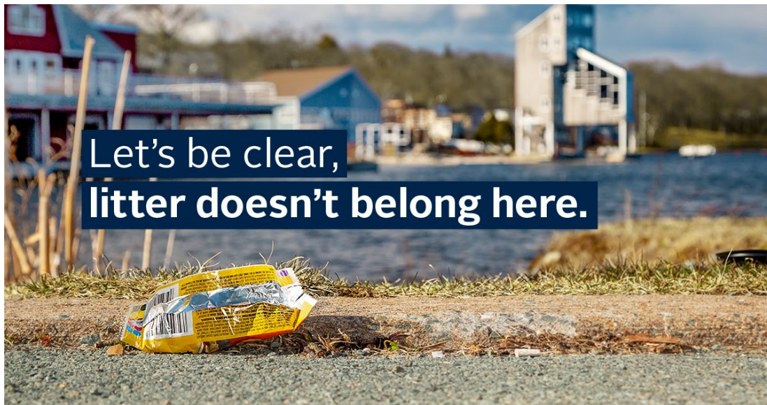
Figure 1: Sample Litter Awareness Campaign Ad

SWR developed the Let's Be Clear – Litter Doesn't Belong Here campaign under Council direction 4 in 2018 with the objective to put focus on common litter items and show where they are frequently found. The ads feature easily recognized landmarks around HRM to connect the pride residents have in our municipality with the negative effects of litter. A sample of one of the ads is shown in Figure 1 below. The campaign can be promoted year-round through paid advertisements, digital screens in HRM facilities and social media posts. This campaign raises awareness of the issue of litter and is a call to action.