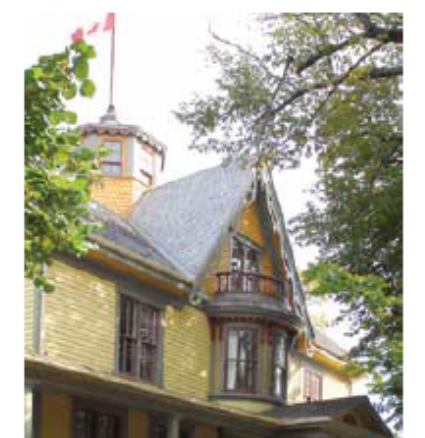
When the windows of Lefurgey House in Summerside, PEI were damaged in a fire, instead of replacing the entire windows, only the broken glass was replaced. The replacement glass, salvaged from a nearby house that was replacing its windows, had similar properties and wavy appearance.

Conserve heritage value by adopting an approach calling for minimal intervention.