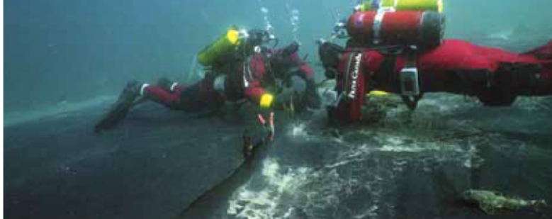
Wrecks at Red Bay NHSC, NL, such as this Basque Period wreck, are reburied using sand and tarp to ensure their long-term preservation. Their condition is periodically assessed through monitoring.

patched and repaired using the moulds to match