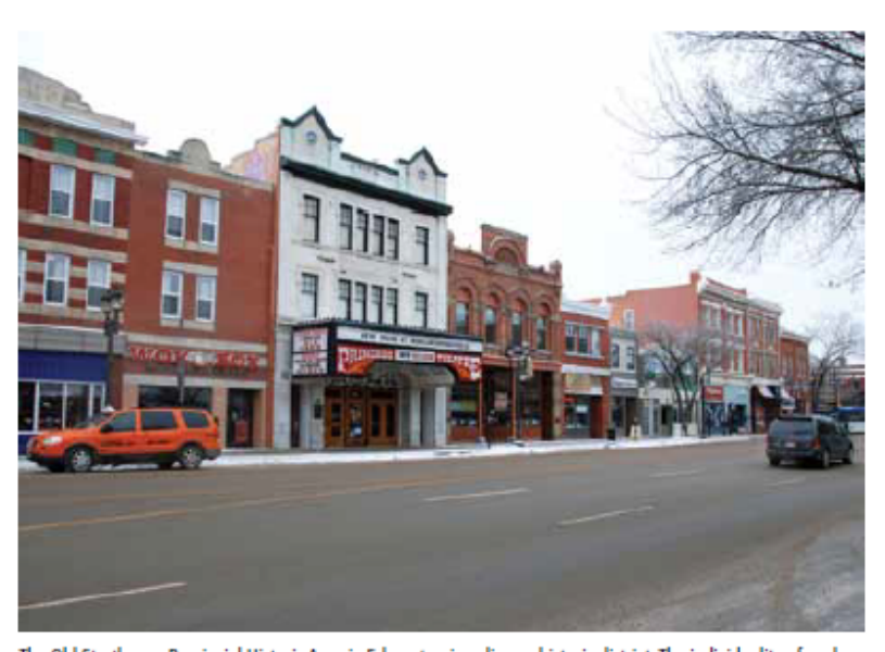
The Old Strathcona Provincial Historic Area in Edmonton is a diverse historic district. The individuality of each building and evidence of the era of its construction has been maintained. Earlier simply constructed wood buildings stand alongside later more sophisticated masonry buildings and modern infill structures.

The materials removed from historic places are often salvaged and reused. Careful consideration must be given to how and where this is done. For example, using a salvaged lamppost from an historic landscape with identifiable characteristics at another site does not conform to the standard. On the other hand, using recycled bricks of the same age and appearance, or reusing identical windows within a building are appropriate from both conservation and sustainability standpoints. Where it is deemed critical to the honesty of the work, such additions can be rendered distinguishable in a discreet way.