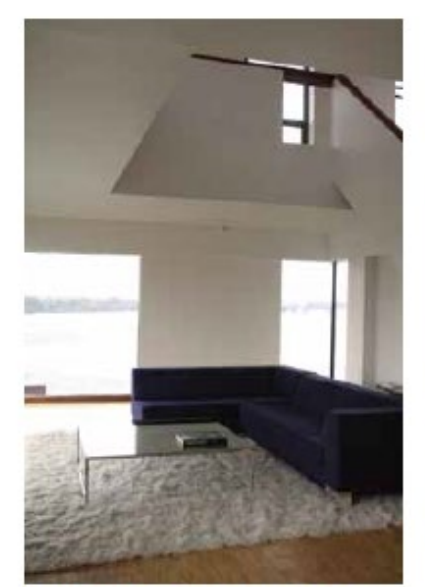
The character-defining interior features and finishes, such as the birch floors, window frames and views of the city at Habitat 67 in Montreal, have been carefully maintained, repaired and retained.

(a) Conserve the heritage value of an historic place. (b) Do not remove, replace or substantially alter its intact or repairable character-defining elements. (c) Do not move a part of an historic place if its current location is a character-defining element.