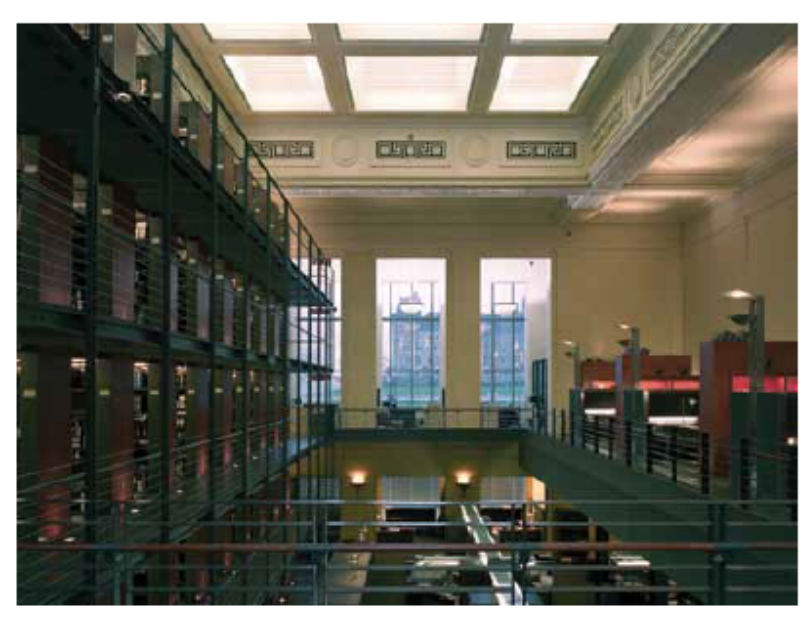
Space to temporarily house the Library of Parliament in the former Bank of Nova Scotia Building on Sparks Street in Ottawa. The entire intervention was designed to be reversible.

The dome of Melville City Hall was originally an uninsulated, painted-metal covering that caused persistent condensation problems. Applying insulating polyurethane foam with aluminized coating was a cost-effective solution that was compatible with the historic metallic look of the dome. If a more elaborate solution is contemplated in the future, the polyurethane could be removed.