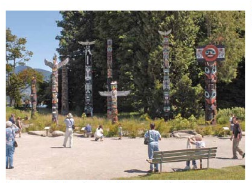
Over the years, several landscape architects and architects have made specific contributions to the evolving functions of Vancouver's Stanley Park. These include the play areas, totem groupings and aquarium that are now integral to the park's heritage value.

A fine old storefront that has been modernized may have lost its heritage value. However, some changes may have acquired value, such as an art-deco stainless steel over-cladding or a marquee added to a popular urban theatre. Not every change to an historic place has heritage value, but those that do should be identified in a Statement of Significance. For historic places that were formally recognized some time ago, the process of determining if there is heritage value associated with later changes is an important step in the conservation process.