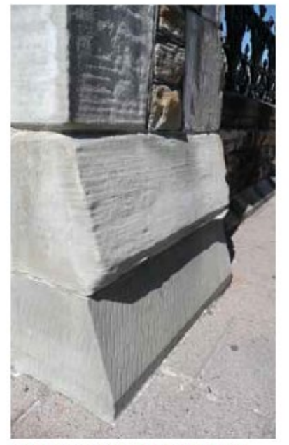
The new pieces of stone on the Wellington Wall at the Parliament Grounds in Ottawa are clearly visible on close inspection due to a different tooling technique.

While the main reason for making interventions identifiable is honesty, it is also a means of keeping a record of the place. The historic place itself is its own best document.