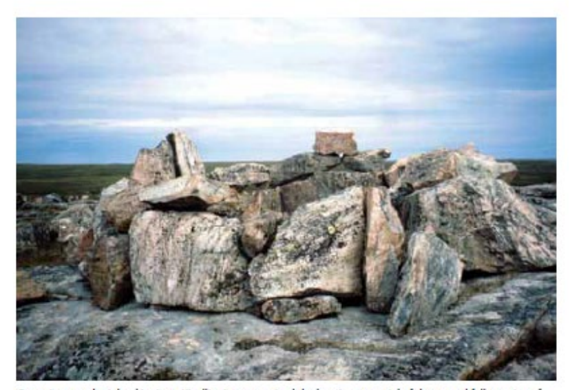
Centuries ago, the inland Inuit, or Kivallimiut, recognized the hunting potential of the annual fall crossing of massive herds of caribou and began establishing seasonal camps along the Kazan River. Today Fall Caribou Crossing NHSC in Nunavut, is noted not only for its archaeological remains and former importance to the Kivallimiut, but also for its natural landscape, continued use as a hunting area and the vitality of the oral history and traditions of the people who know it best. Moving any of these stones would impair heritage value.

Part (c) addresses the wholeness of a place and reinforces that spatial relationships can be character-defining. In a garden, for example, moving a central feature to another location affects the heritage value of the entire landscape. In an archaeological site, location may be critical to understanding other elements that are now missing. In an engineering work, machinery moved from its original position can lose part of its meaning, thus diminishing its heritage value.