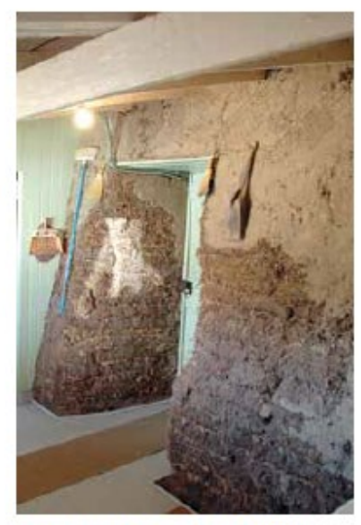
The lean-to is a character-defining element that shows the evolution of the Addison Sod House in Saskatchevan from a rustic sod dwelling to a comfortable home. Removing the later changes to restore the house to an earlier period would not be appropriate because it would remove elements that have heritage value.