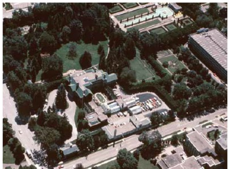
The grand residential estate at Parkwood in Oshawa is a cultural landscape that covers 4.8 hectares. Aerial photography was used to document the large-scale site during the conservation process.