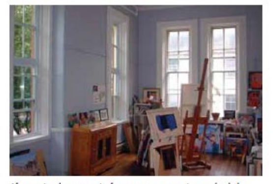
After serving the community for many years as a primary school, the Charlotte Street School in Fredericton now has a new community use as the Charlotte Street Arts Centre. This use required little change to the building's layout and character. Classrooms were maintained to serve as open art studios, dance and music studios and an art gallery. The existing wide corridors and staircases, as well as the classrooms and other spaces, fit the new needs well.