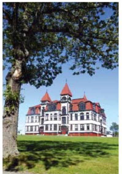
Despite changing requirements in education, the Lunenburg Academy in Nova Scotia remains in its original building and setting. The Academy was designed using green space, natural lighting and ventilation in a way that is still valid for school use today.

In the case of archaeological sites, the intention is seldom to use the archaeological site itself, but rather the space that contains it. It is therefore important that a new use requires minimal intervention and does not alter the character-defining elements that are often submerged or buried underground.