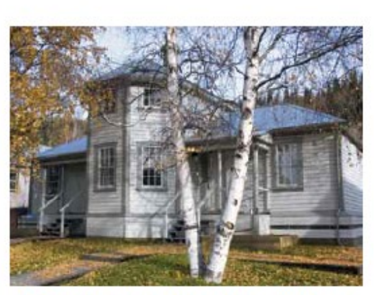
This Dawson City building, originally built to be the temporary location for the government telegraph office, was rehabilitated into housing units.