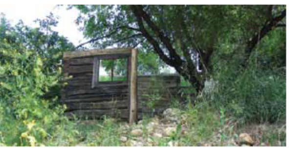
The character-defining elements of Doukhobor Dugout House NHSC in Saskatchewan, such as the window frames, had suffered visible deterioration from exposure to the elements. A long-term repair solution was necessary to prevent further decay and to preserve the site's heritage value.

Following the reinforcement treatment of treating the logs with preservatives, collapsed character-defining elements were reassembled based on records from previous interventions and existing traces on the site.