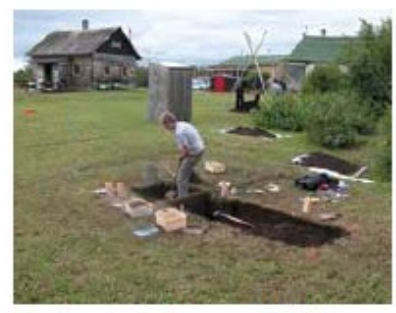
Ground-penetrating radar was used at McPherson House in Fort Simpson, NT; this guided archaeological excavations limiting the impact on the site.

(a) Evaluate the existing condition of character-defining elements to determine the appropriate intervention needed. (b) Use the gentlest means possible for any intervention. Respect heritage value when undertaking an intervention.