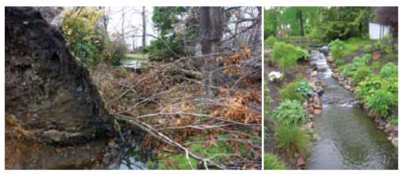
The extensive damage caused by Hurricane Juan to the Halifax Public Gardens required substantial replanting. The large scope of work is still considered a minimal intervention because any less work would have negatively affected the heritage value of the place.

Minimal intervention has different meanings for Preservation, Rehabilitation and Restoration . In the context of Preservation, it means undertaking sufficient maintenance or repairs to ensure the longevity of the place while protecting heritage value. In the context of Rehabilitation , it might mean limiting the proposed new use, addition or changes. In a Restoration , minimal intervention is a delicate balance between removals and recreations to represent the historic place's condition at a specific time in its history.