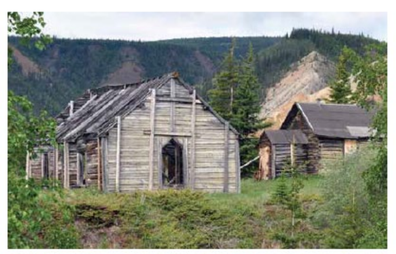
These buildings, along with others at St.Luke's Anglican Rectory and Church in the Yukon, were temporarily stabilized using a variety of measures including adding sandwich bracing, cable bracing, heavy frames, roll roofing, and covering door and window openings in order to keep out snow and rain. Stabilization allows the structures to be adequately researched and their eventual restoration to be planned.