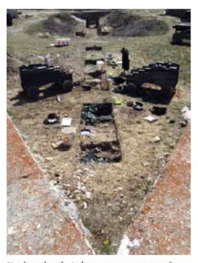
Nearby archaeological resources were protected when stabilizing the Prince of Wales fort in Manitoba. Strategically placed archaeological investigations on the surface of the ramparts established the extent of artifacts, including their depth below the surface.

Part b) acknowledges a responsibility to protect archaeological resources, but also reinforces the message that they must be protected and preserved in situ. This is a highly regulated aspect of conservation: one must identify and engage the authority having jurisdiction. The information required to best preserve and protect the site is gained from a variety of archaeological interventions. A strategy to recover the information using the most appropriate and effective methods needs to be developed in an effort to strike a balance between gaining knowledge from investigations and preserving the resources in situ.