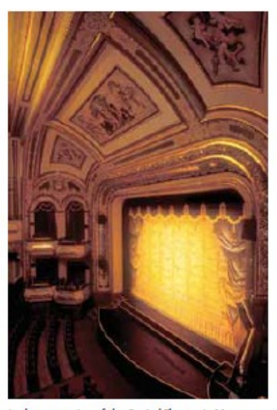
In the restoration of the Capitol Theatre in Moncton, photographic and physical evidence supported restoring the interior decorative frescoes in their original colours. Other elements, such as the marquee, were reproduced from documentary photos using new elements to match the forms, materials and detailing.

The reconstruction of an entire historic place is not considered conservation and is not addressed in this document. However, the recreation of a missing built feature in a landscape or heritage district is best regarded as an addition to an historic place, and would be subject to Standards 11 and 12.