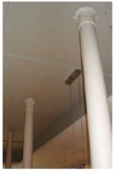
These cast iron columns were uncovered and restored when CentreBeam Place, in St. John, was rehabilitated.

(a) Repair rather than replace character-defining elements from the restoration period. (b) Where character-defining elements are too severely deteriorated to repair and where sufficient physical evidence exists, replace them with new elements that match the forms, materials and detailing of sound versions of the same elements.