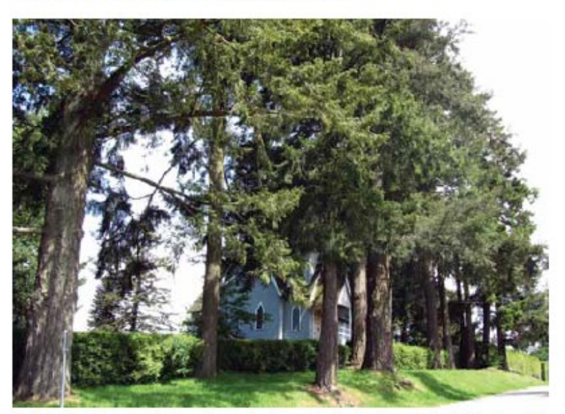
The rhythmic pattern created by the regular spacing of trees along the street is a character-defining element of the Avenue of Trees in Surrey, BC that can be used as evidence to restore the row if a gap develops.

A preservation or rehabilitation project may also include elements of restoration, such as work on an ornamental fountain in the centre of a formal garden. Any restoration interventions must be based on clear physical, documentary or oral evidence and detailed knowledge of the earlier forms and materials.