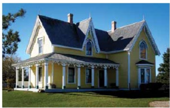
Based on documentary evidence, including an 1880 engraving, the original fenestration of the Bideford Parsonage Museum in P.E.I. was restored and roof finials replaced.