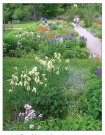
In areas of Maplelawn and Gardens NHSC in Ottawa where insufficient historical evidence existed, a Rehabilitation approach was taken. New perennial beds were designed using adjacent layouts and historical information from other parts of the garden as inspiration. This approach resulted in compatible new beds that completed the garden and strengthened its overall heritage value.

Addressing significant deterioration is an implicit goal of this standard. If deterioration is not properly addressed, it can result in a loss of heritage value.