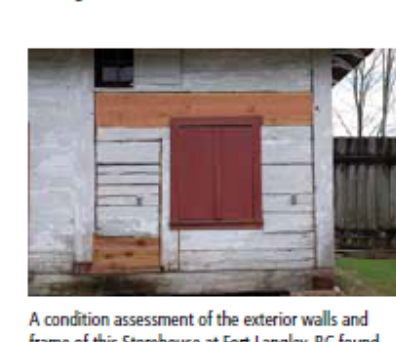
A condition assessment of the exterior walls and frame of this Storehouse at Fort Langley, BC found extensive deterioration of some timbers, which required replacement in kind. The dimensions, hewn finish and species of wood used in the repairs matched those replaced. The photograph shows part of one storehouse wall after the repairs were completed, but before the new timbers were whitewashed.

Replacement in kind may sometimes be difficult, and substitute materials may be necessary when the original materials are damaging to character-defining elements or hazardous to public health. Some mid-20th century materials are no longer made or cannot be manufactured in small batches. In a place where the heritage value depends on a material that is no longer available, the ongoing loss of the material will eventually lead to a difficult choice: accepting breakage or replacing the entire material or assembly with one that is physically and visually compatible with the original.