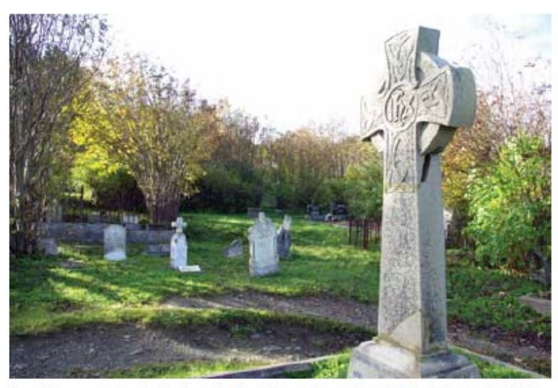
A condition assessment and evaluation undertaken before an intervention at Belvedere Cemetery in St.John's Ecclesiastical District, would reveal that the well-aged and weathered patina found on the grave markers is not damaging. It is in fact a character-defining element of this historic place and should be preserved.

Investigations themselves are forms of intervention and as such should follow a minimal intervention approach. Investigations should begin with observation and non-invasive probes followed by careful sampling and physical openings or selective disassembly if required. The objective is to obtain enough evidence without unnecessarily disturbing the historic place.