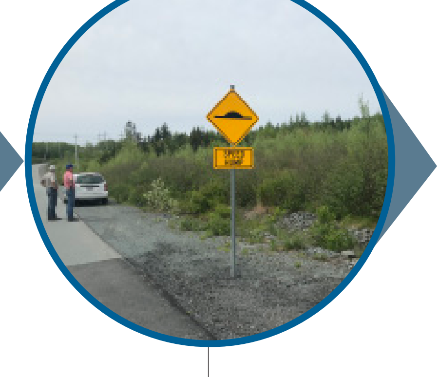
SITE INVENTORY AND ASSESSMENT