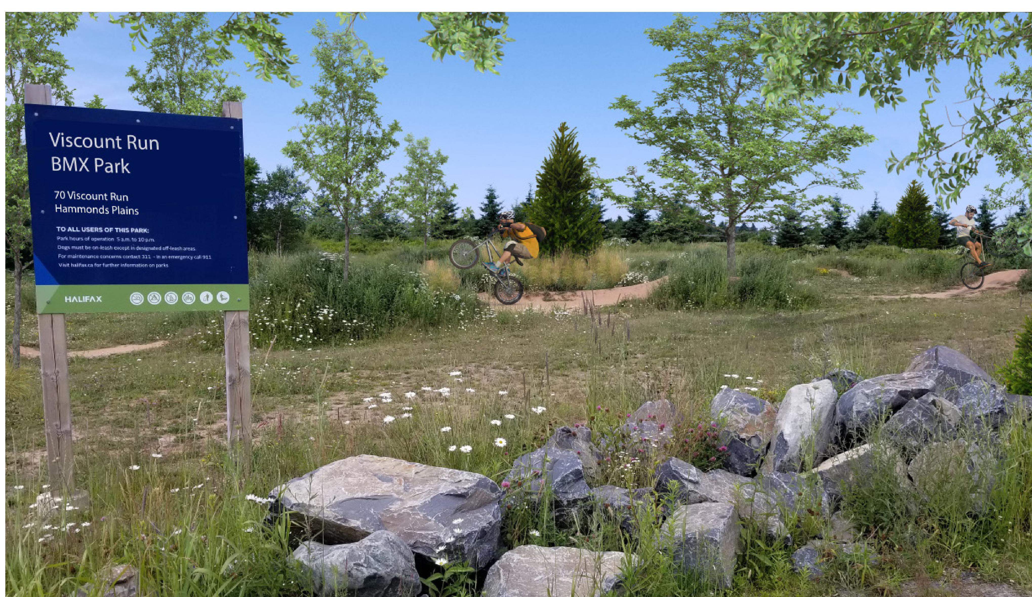
VIEWS FROM WITHIN THE BMX AREA