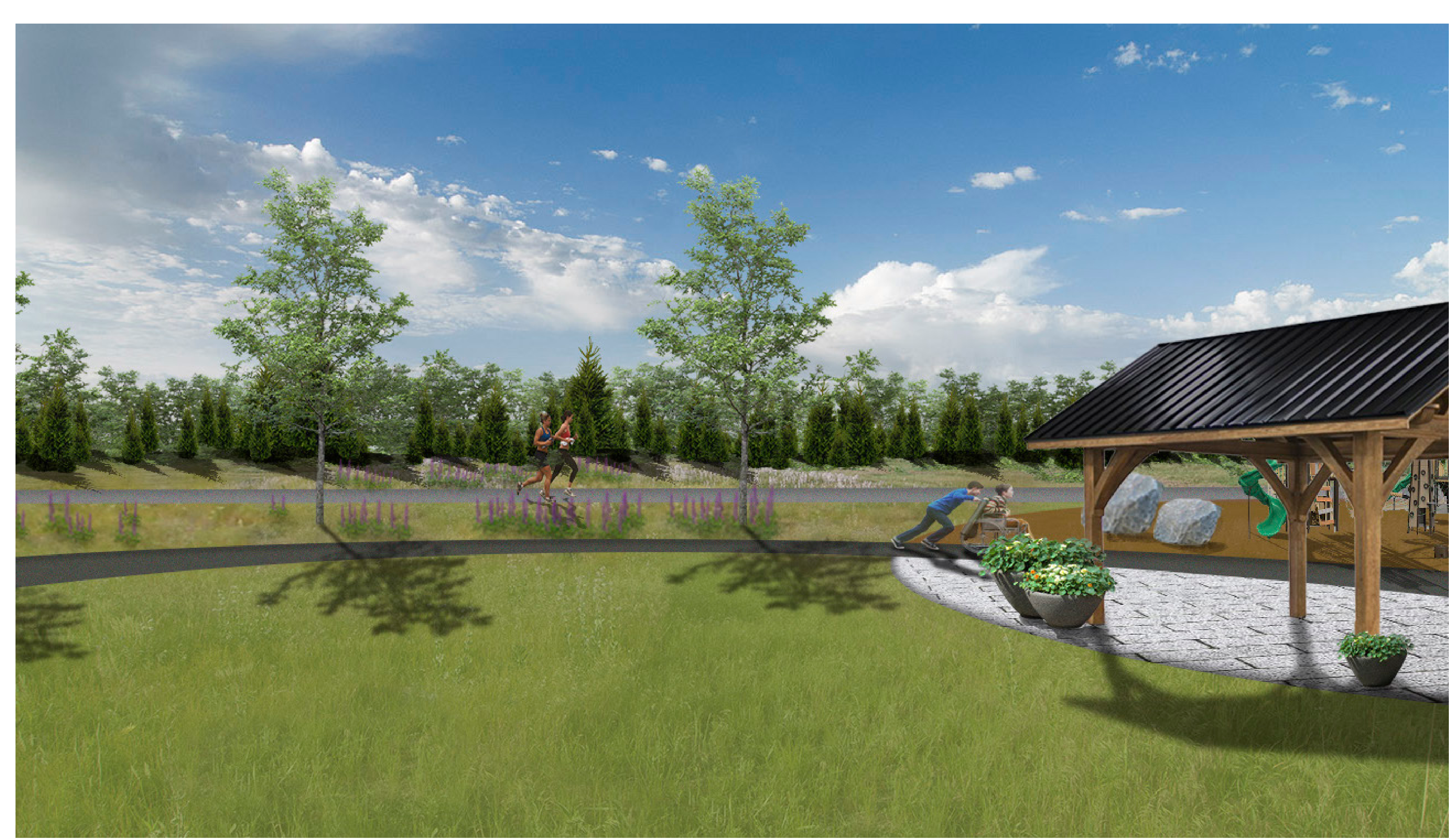
VIEWS FROM THE PLAY LAWN