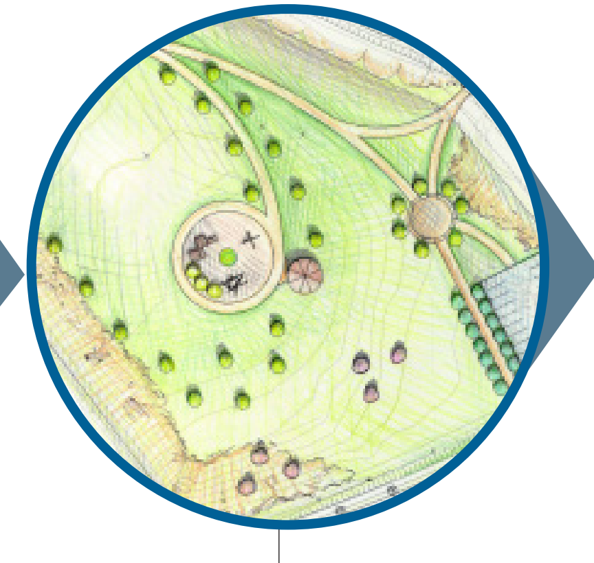
CONCEPTUAL DESIGN DEVELOPMENT