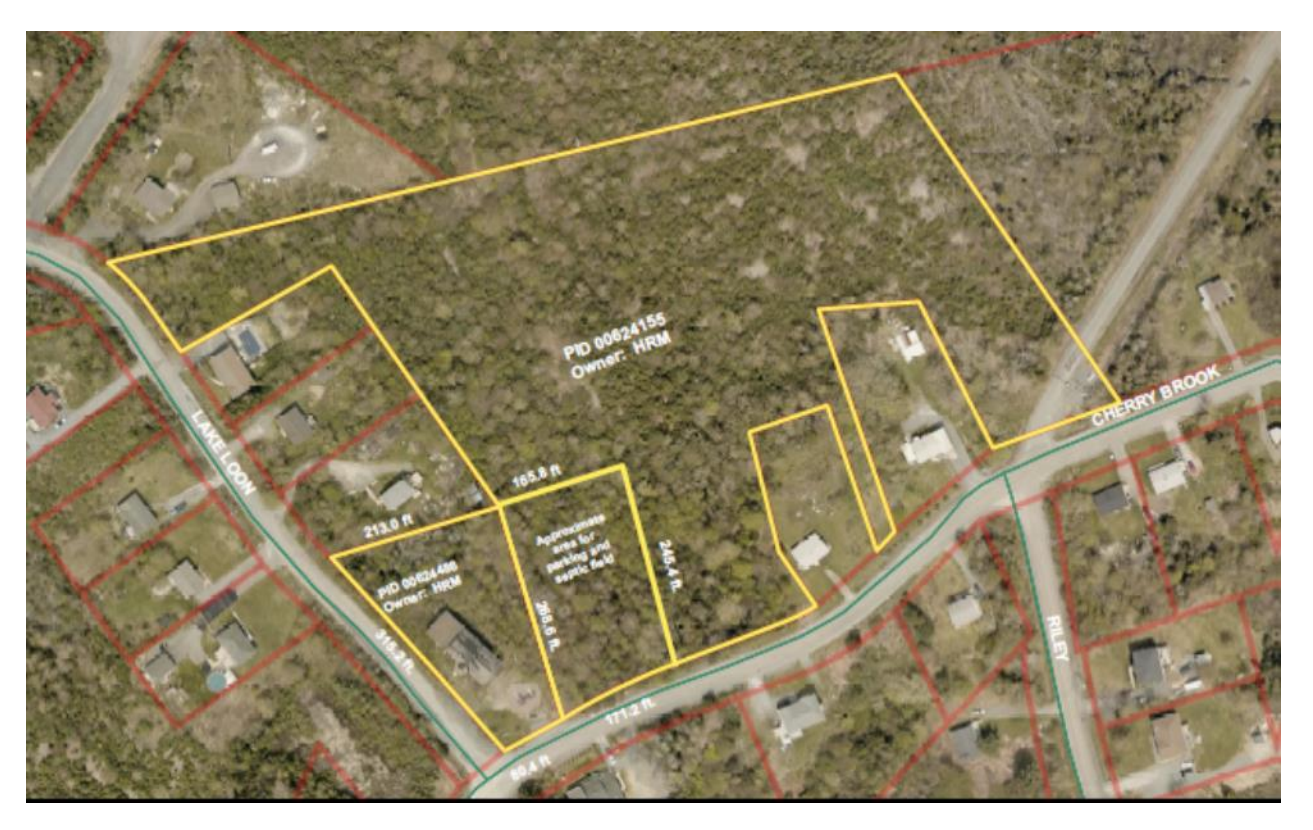
Figure 1 - Site Map - 220 Lake Loon Road and Approximate Portion of 266 Cherry Brook Road

After completing a process to determine the validity of property ownership, the municipality wanted to provide the opportunity for the community to acquire the property. The process to transfer ownership is governed by Administrative Order 50 – Disposal of Surplus Real Property. On April 28, 2015, 220 Lake Loon Road was declared surplus to municipal purpose under the category of Community Interest by Regional Council. A portion of 266 Cherry Brook Road was also declared surplus under the same category. (If the successful submission required the additional property to be subdivided for support services)