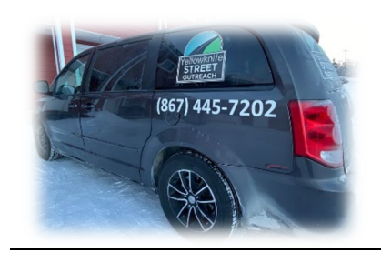
Table 4: Mobile Outreach Vehicle Images | Cross-Jurisdictional Examples